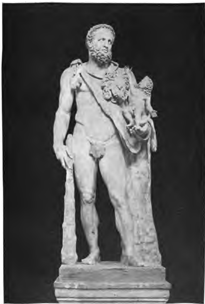
Fig. 64. Heracles.